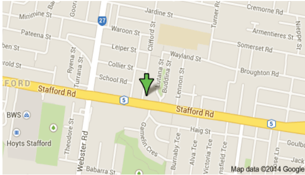
7 Clifford St, Stafford