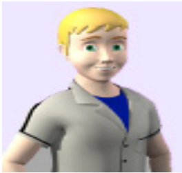
A selection of the program's engaging teaching tools

That's where the Secret Agent Society comes in.